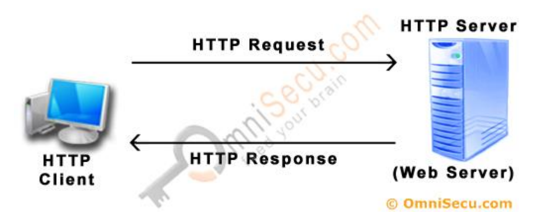
1) <u>HTTP Client Request:</u> Hypertext Transfer Protocol (HTTP) client sends an Hypertext Transfer Protocol (HTTP) Request to the Hypertext Transfer Protocol (HTTP) Server